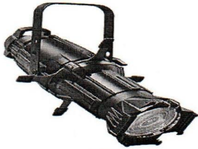
ETC Source Four 26° Profile - 1

THE SPECIAL REQUIREMENT RECEIVED FROM GEORGIA THEATRE GROUP IS PLACED BELOW: PLEASE NOTE THAT THESE REQUIREMENTS ARE ADDED IN THE ABOVE TECH RIDER.