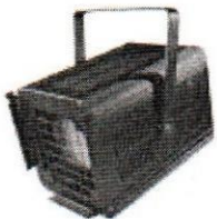
EUROLITE PC SPOT 1000W - 2