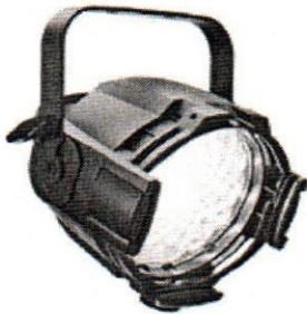
Source Four PARNet - 4