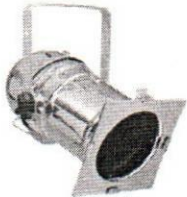
par64 1000W- 7